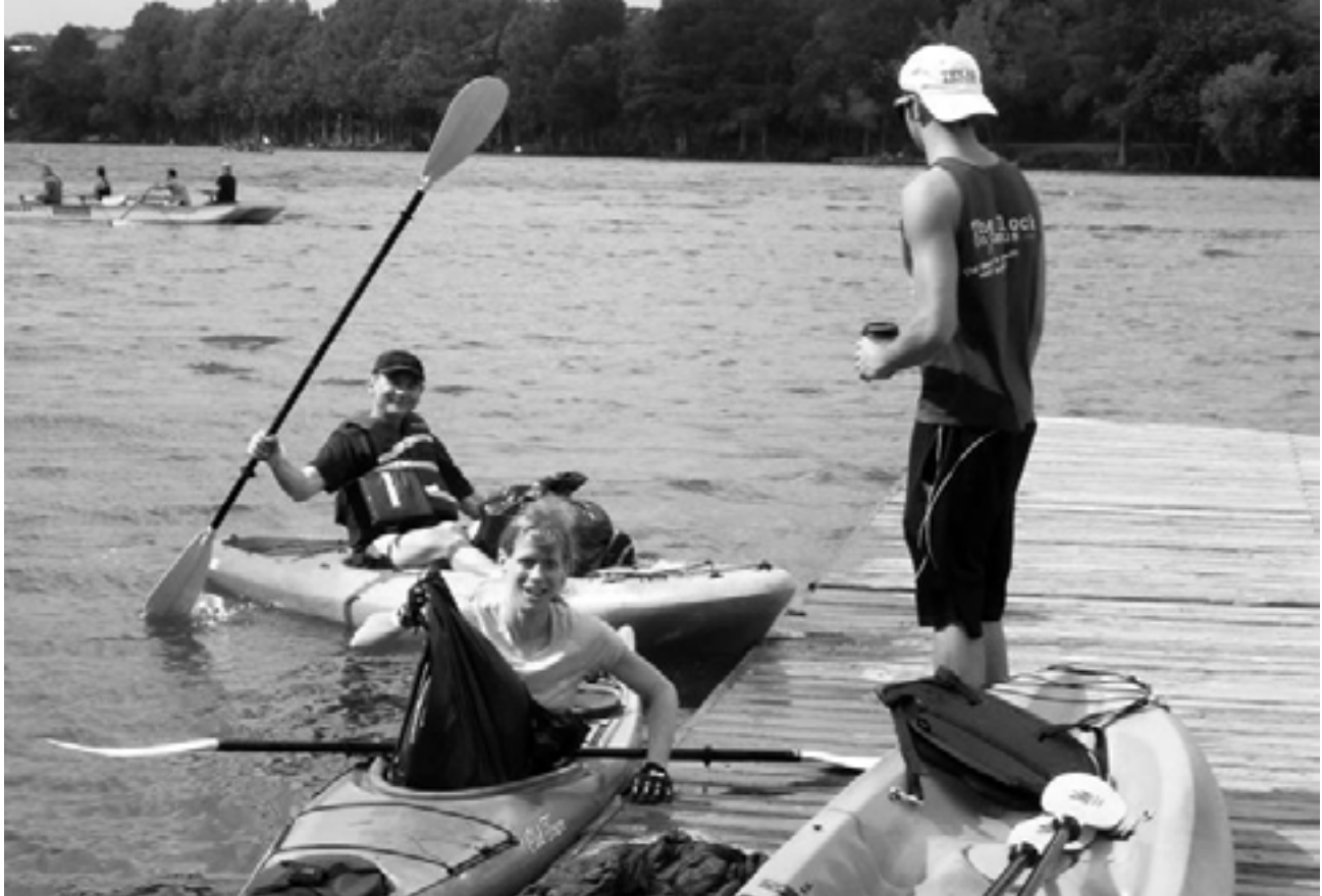
Sierra Club members joined in the Lake Cleanup with Keep Austin Beautiful