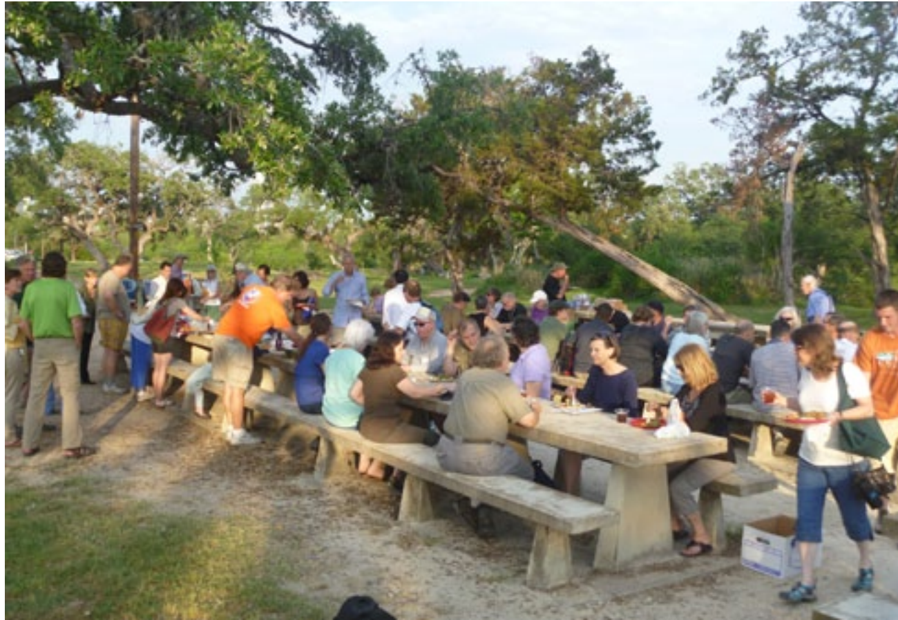
Austin Sierrans at the annual picnic